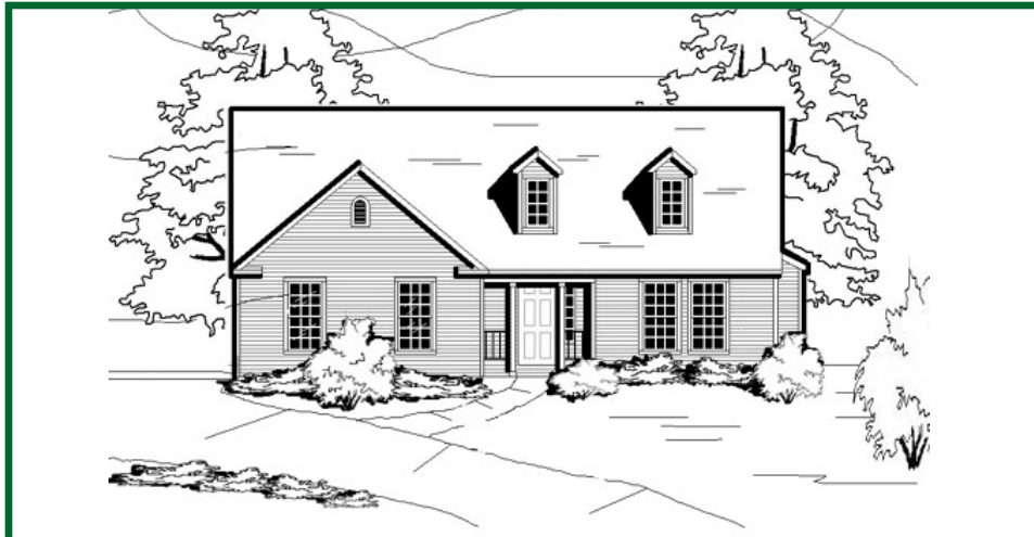
3 Bedrooms - 2 Bathrooms - 1,387 Sq Ft

The Donovan is a great example of Dave Weiss' experience in home design, where every inch of a home is easy to live in. This home features 3 bedrooms, including a separate owner's suite, & an open concept living space that has room for everyone in the kitchen, dining area & family room. First time home buyers & empty nesters alike will enjoy the convenience of Victorian Farms "in the middle of everything." Within minutes from Lake Michigan's beaches & weekend getaways; convenient to South Bend's shopping, restaurants & airport.